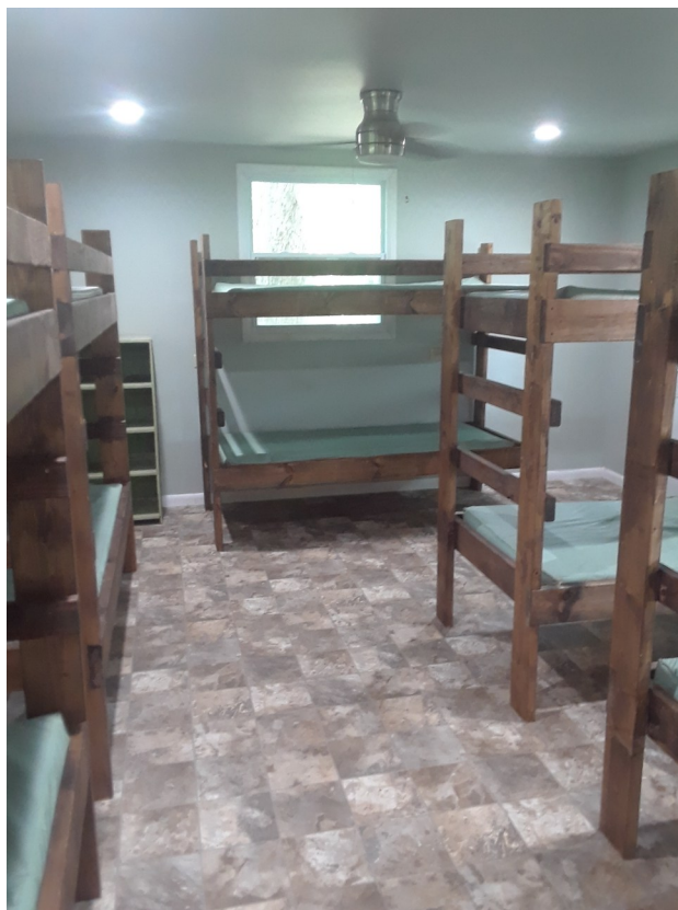
Above: The DougOut cabin holds 6 bunkbeds Below: Summer cabin and tent camping

There is also a brick BBQ right next to the picnic shelter. With adjustable racks for coals or wood, this BBQ can easily cook for several dozen people at once.